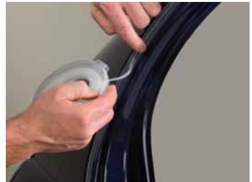
3M™ Smooth Transition Tape