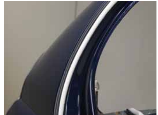
3M™ Soft Edge Foam Masking (SEFMT)