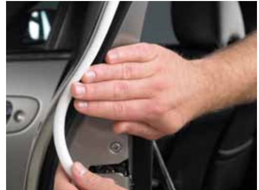
3M™ Soft Edge Foam Masking (SEFMT)