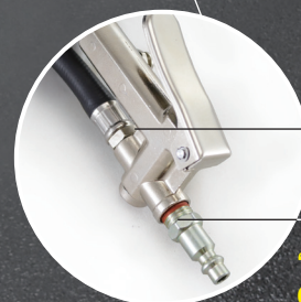
"M" STYLE FITTING ON TOOL