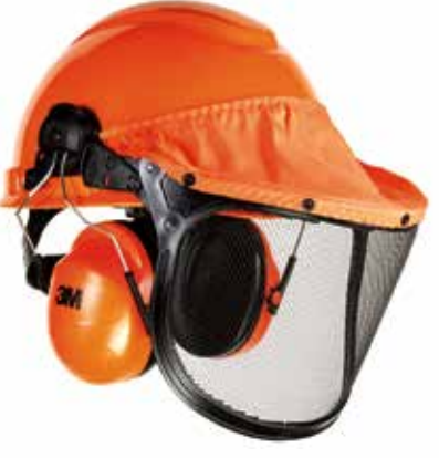
3M combination systems blend head and face protection in one meticulously engineered system for reliable protection and convenience.