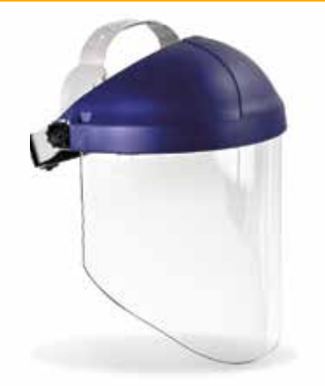
Designed for industries requiring face coverage, our faceshields offer reliable protection with versatile features.