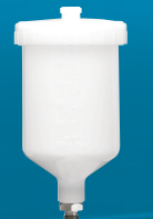
600ml Plastic Cup PCG600P-2 #6039

The SUPERNOVA delivers a consistent droplet size when atomizing. This, combined with the flat, even SUPERNOVA pattern, helps reduce common application issues. All SUPERNOVA guns are equipped with stainless steel fluid passages ideal for any type of material, solventborne or waterborne.