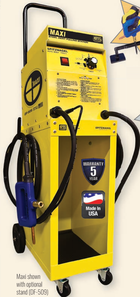
Maxi shown with optional stand (DF-509)