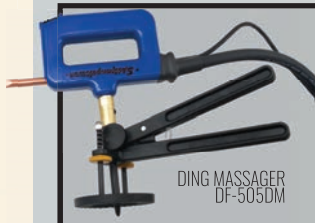
DING MASSAGER DF-505DM