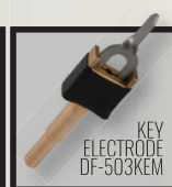
KEY ELECTRODE DF-503KEM