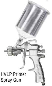
HVLP Primer Spray Gun