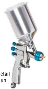
HVLP Detail Spray Gun