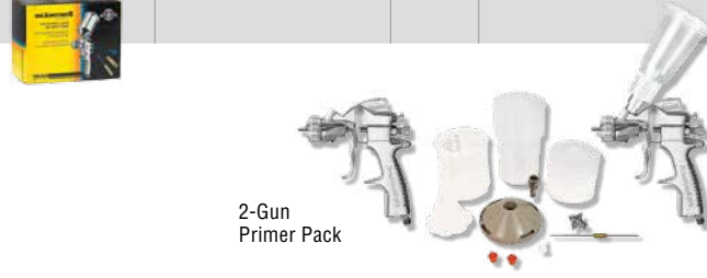
2-Gun Primer Pack