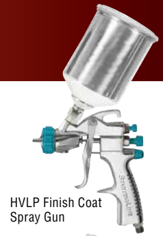
HVLP Finish Coat Spray Gun