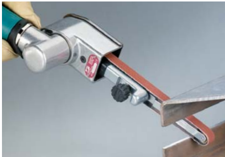
.4 hp Dynaflex® II is ideal for deburring and finishing in tight areas.