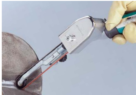
Optional 11204 Contact Arm offers ability to grind into contours.