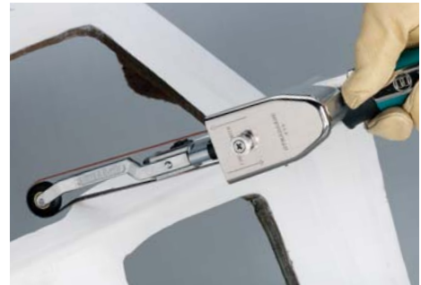
Optional offset Contact Arm allows belt to conform to a variety of contours.