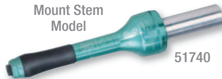
Mount Stem Model