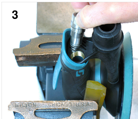
59335 Inlet Bushing removed.