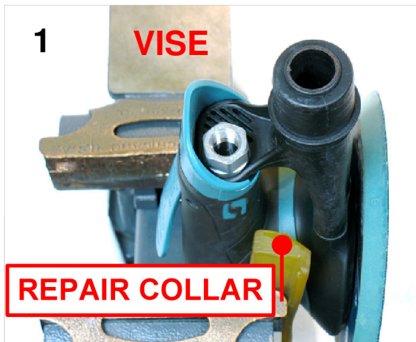
Position 57092 Repair Collar around housing. Fasten sander in vise with exhaust pointing up.