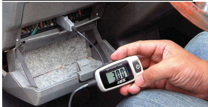
302M Fuse Buddy Tester in action