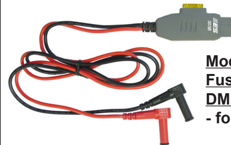
Model 303B Fuse Buddy DMM Adapter - for ATC fuse