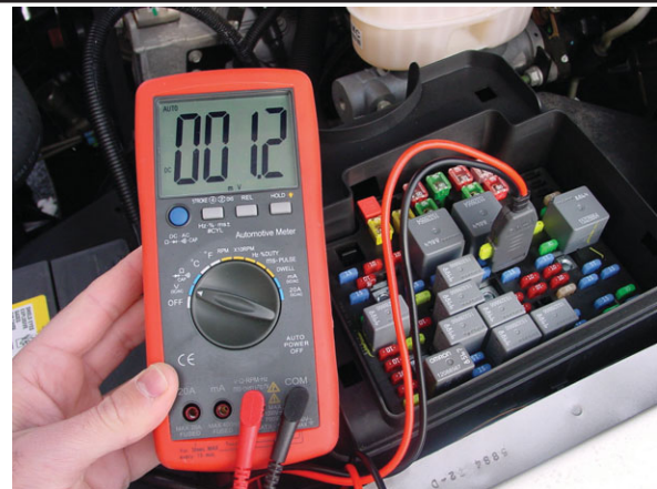
301M Fuse Buddy DMM Adapter in action