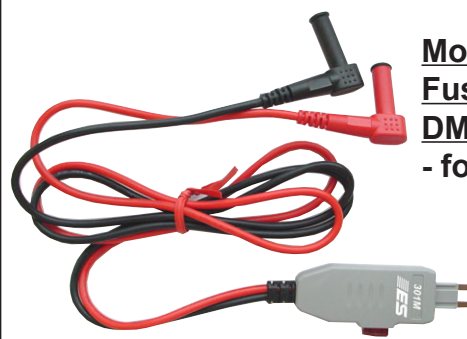
Model 301M Fuse Buddy DMM Adapter - for mini fuse