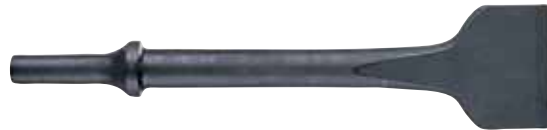
No. CH103 1-1/2" Flat Chisel .401