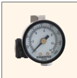
PN U04410 (p. 27)