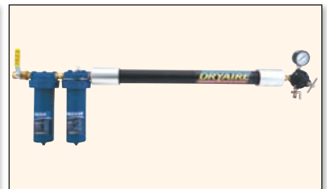
PN 6770 (p. 17)