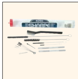
PN 8260 (p. 30)