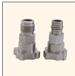
PN 253969 (p. 26)