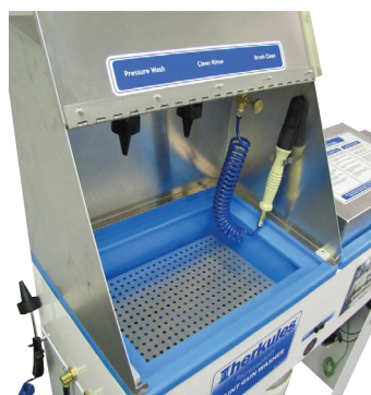
G520 manual cleaning tank

Enjoy thorough single-handed cleaning of EITHER waterborne or solvent paint guns with these two lightweight units. The Quick Clean G507 with its powerful pump can go anywhere that can access an air-line, while the G45 Fast Track Paint Gun Washer is powered by Herkules Sparkle Clean Blast, enabling portable pumpless cleaning practically anywhere.