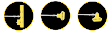
Versatile horizontal and vertical positioning

1,000 120 8.3 18" 24 WATTS VOLTS AMPS HEAD LBS