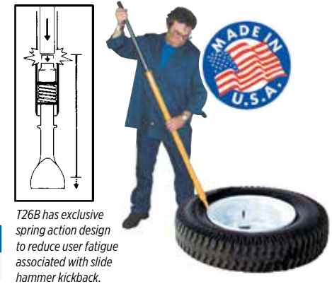
T26B has exclusive spring action design to reduce user fatigue associated with slide hammer kickback.