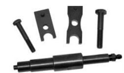
TU-15-41 PERKINS AND CATERPILLAR