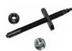
TU-15-40 PERKINS 4.108 ENGINES