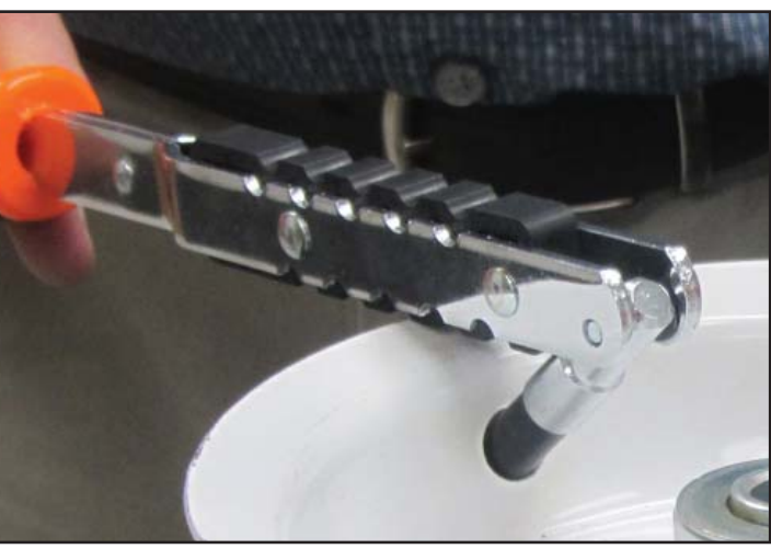
1410: Tire Valve Installer