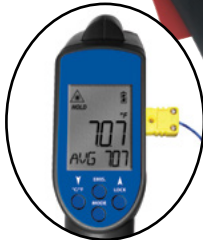
Optional Wire Thermocouple