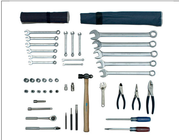
Tool Box Included - BX21