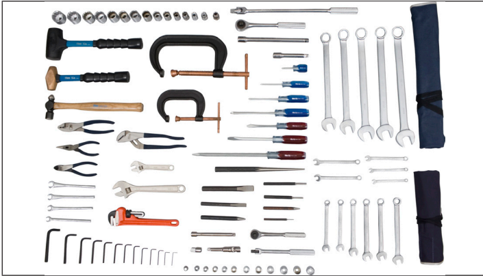
Tool Box Included - BX26