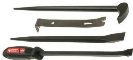
76295 - 4 Pc Utility Pry Bar Set