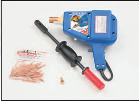
JO1000 - ENTRY KIT

The Magna-Spot® 1000, 1500 and 2000 Series products all incorporate our exclusive Low-Heat technology, designed for today's high-strength steel unibody vehicles. With plenty of power for any job, these welders virtually eliminate 'burn-through', a common problem associated with other models.