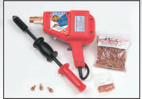
JO1500 - PROFESSIONAL KIT