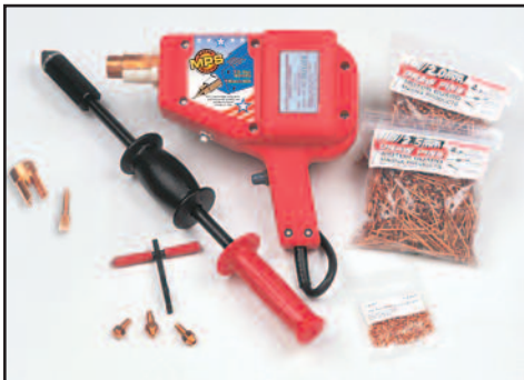
JO1525 - PRO-PLUS KIT