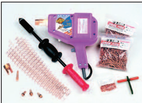
JO2250 - SUPER-PRO PLUS KIT