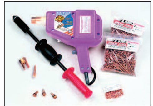
JO2000 - SUPER-PRO KIT