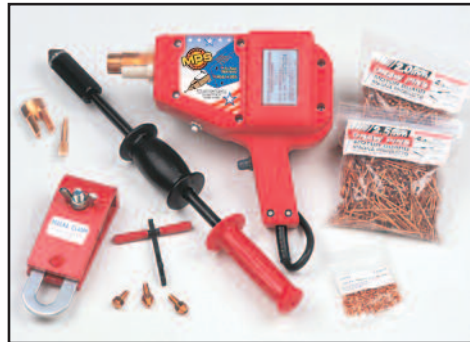
JO1550 - DELUXE KIT