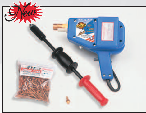
JO1050 - ENTRY-PLUS KIT