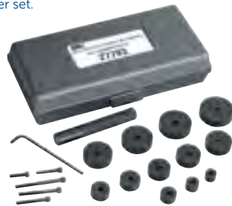
Starter Set 27793