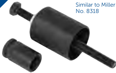
Similar to Miller No. 8318