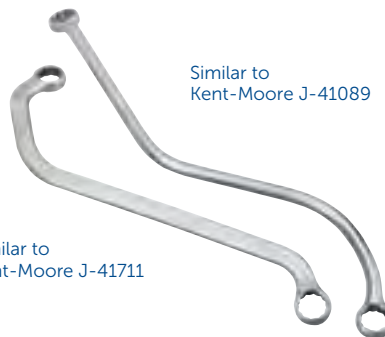
Similar to Kent-Moore J-41089