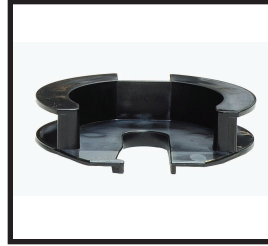
Locating Disc PN# M0022