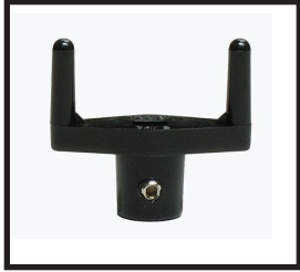
Fork Adaptor PN# M0018X