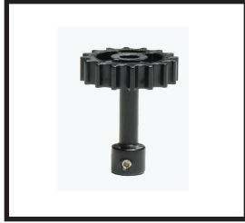
Gear Adaptor PN# M0017X