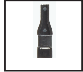
Tower Extension PN# M0030A (Only included in Gallon kits)