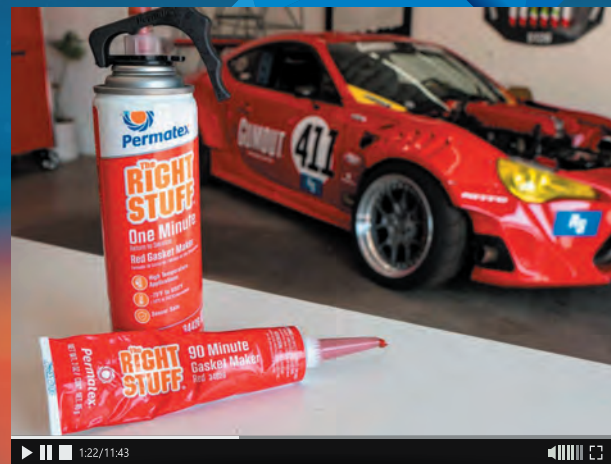
RED GASKET MAKERS