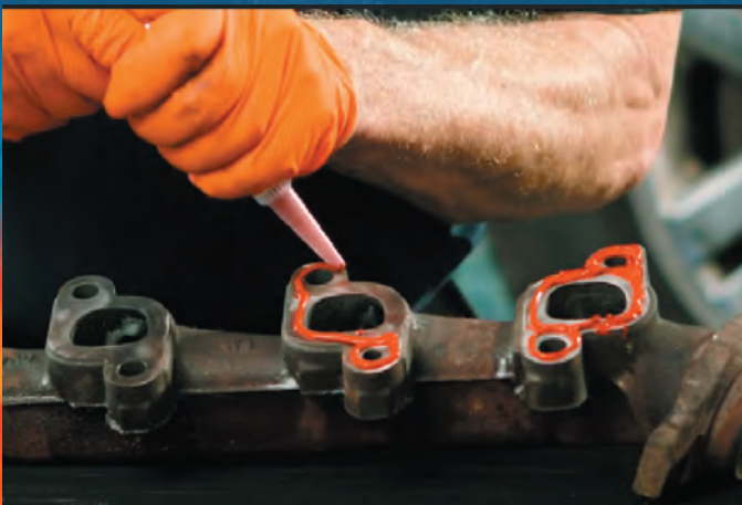
COMMON GASKET MAKER MISTAKES