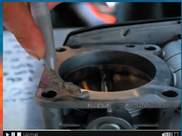
SELECTING AND APPLYING THE RIGHT GASKET MAKER