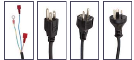
6012 6012-240 6012-P 6012-EUR 6012-AUS