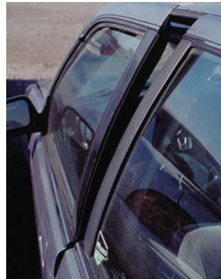
18" Collision WRAP for "sprung" doors.