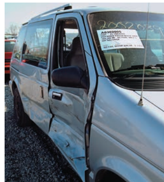
48" Collision WRAP covers open side of vehicles