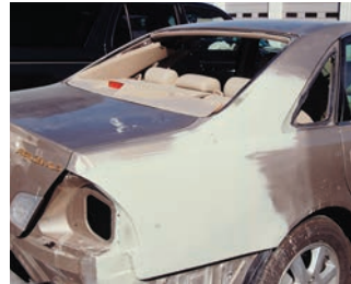
Collision WRAP for sitting vehicle in phases of repair.