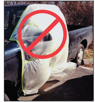
Eliminate jerry-rig attempts to cover crash damaged vehicles sitting outdoors awaiting repair.