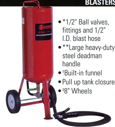
41600 90 Lb Capacity • Uses large type 1 ceramic nozzle