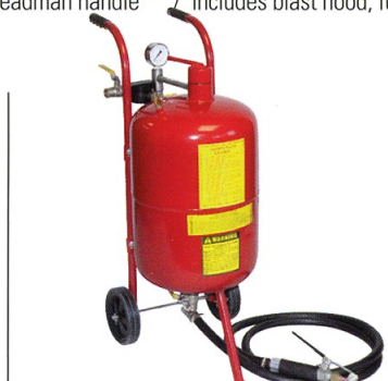
41002 10 Gallon Capacity • Uses type 2 ceramic nozzle