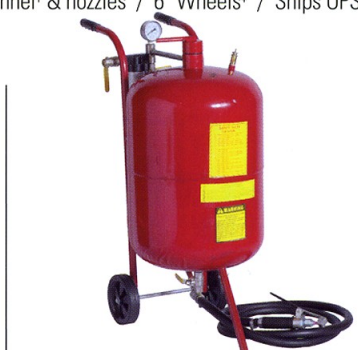
41003 20 Gallon Capacity • Uses type 2 ceramic nozzle