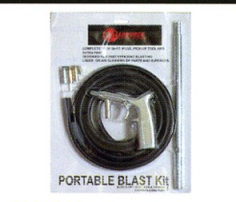
4001544 PortaBlaster • Use abrasives or liquids • 10' hose length • Unlimited capacity • 7-15 CFM @ 80 psi min. • 13/64" & 1/4" steel nozzle included