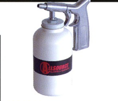
4001244 Bottle Blaster • Use abrasives or liquids • One quart capacity • 15 CFM @ 80 psi • 1/4" steel nozzle • Light weight & portable