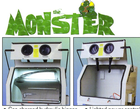
41800 The Monster Cabinet