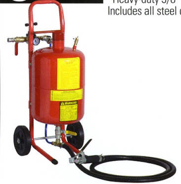
41001 5 Gallon Capacity • Uses type 2 ceramic nozzle

*Heavy-duty 3/8" ball valves and fittings / Safety pressure relief valve / Pressure gauge / Includes all steel deadman handle** / Includes blast hood, funnel & nozzles / 6" Wheels† / Ships UPS