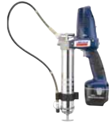
18 V NiCad PowerLuber Model 1842