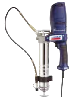
120 V AC PowerLuber Model AC2440