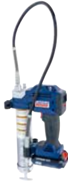
20 V Li Ion PowerLuber Model 1882

Lincoln's PowerLuber family includes a full range of battery-operated grease guns, including NiCad and Lithium-ion-powered tools, as well as pneumatic and electric options. Developed by the lubrication experts, the PowerLuber line has the right grease gun for your needs.