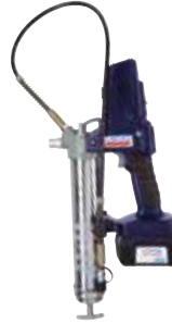
18 V Li Ion PowerLuber Model 1862