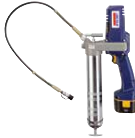
12 V PowerLuber Model 1242