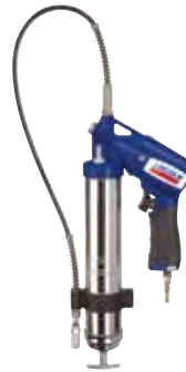
Pneumatic PowerLuber Model 1162