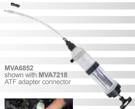
MVA6852 shown with MVA7218 ATF adapter connector