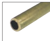
After cutting, tubing needs deburring