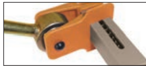
Use on banjo fittings up to 1/2"