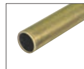
Deburred tubing is smooth, ready for flaring