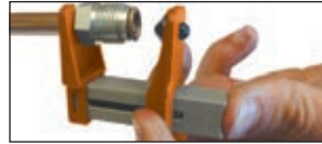
Spring loaded stopper installs in seconds