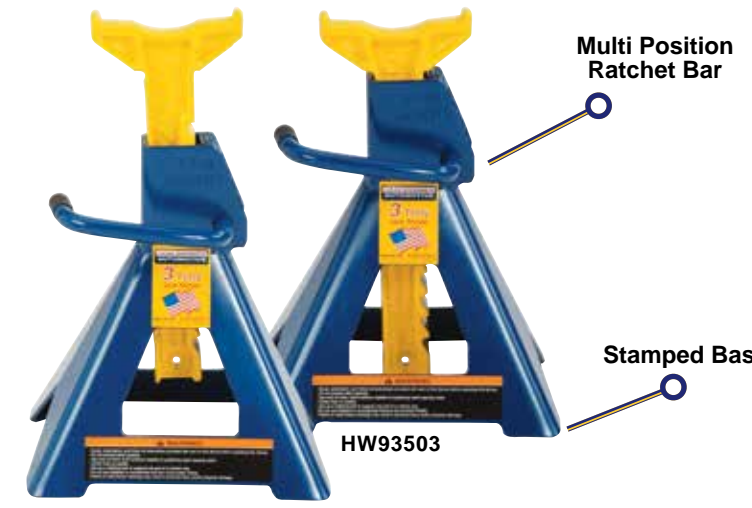
6 Ton Jack Stands