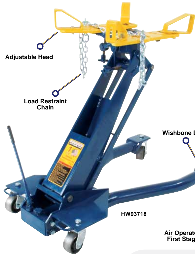
1 Ton Floor Transmission Jack