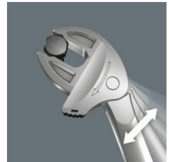
Joker 6004: Ratchet mechanism for fast work

The ratchet function in the mouth sees to fast and consistent screwdriving without removing the tool.