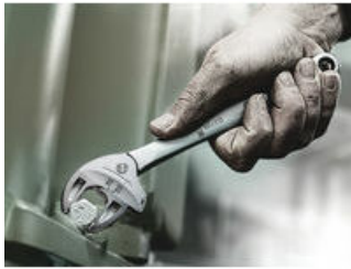
Joker 6004: Automatically and continuously self-setting