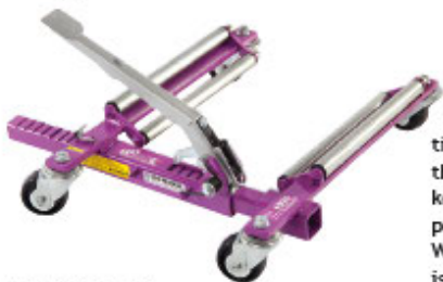
4520 Left Hand Shown 5211 and 6313 Left Hand Available