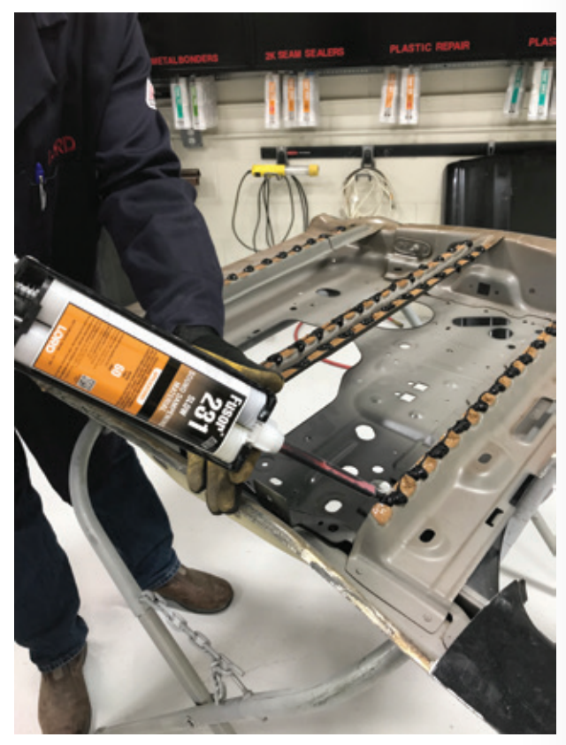
Fusor 231/234 Sound Dampening Material