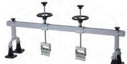
UNI-1093 Uni-Bridge™ Extended Pull 49" (Double Column)