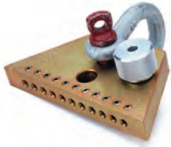
UNI-1080 Uni-Clamp™ Multiple Stud Pin Puller