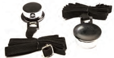
UNI-1094 Uni-Bridge™ Suction Cups w/Straps