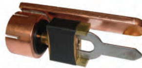
UNI-1063 Uni-Tab™ Adapter For Stud Guns