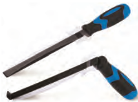
UNI-7800 Uni-Bar™ Taillight/Headlamp Removal Tool