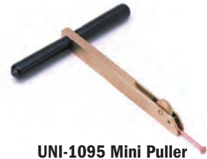
UNI-1095 Mini Puller Mini-Pull™ T-Handle Single Stud Puller