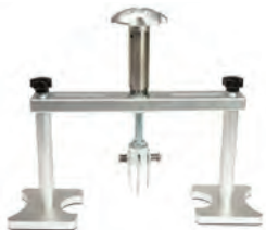
UNI-1091 Uni-Bridge™ Quick Pull 12" (Single Column)