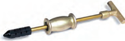
UNI-1016 Uni-Spotter™ Slide Hammer Complete