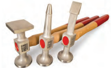
UNI-7803 Aluminum Hammer Set (3-Piece)