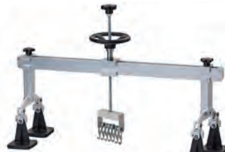
UNI-1092 Uni-Bridge™ Standard Pull 34" (Single Column)