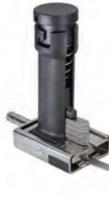
UNI-9600 Tab-Shooter™ Uni-Tab Auto-Feed Tool