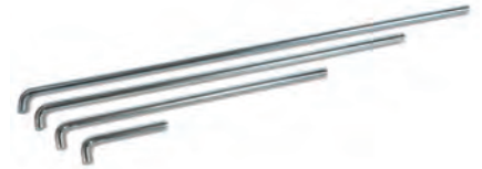
UNI-1065 Uni-Rod™ Tab Pulling Rod Kit (4", 10", 14", 18")