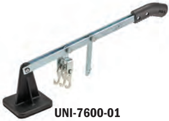
UNI-7600-01 Uni-Pull™ Stud & Tab Lever Pulling Tool