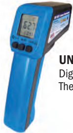
UNI-9851 Digital Infrared Thermometer