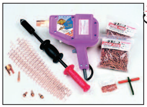
JO2250 - SUPER-PRO PLUS KIT