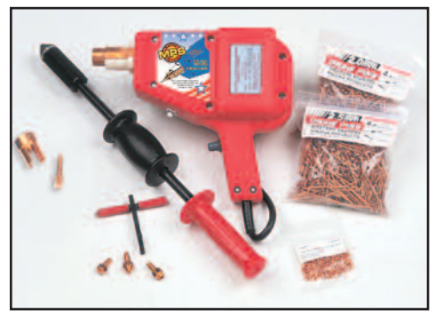
JO1525 - PRO-PLUS KIT