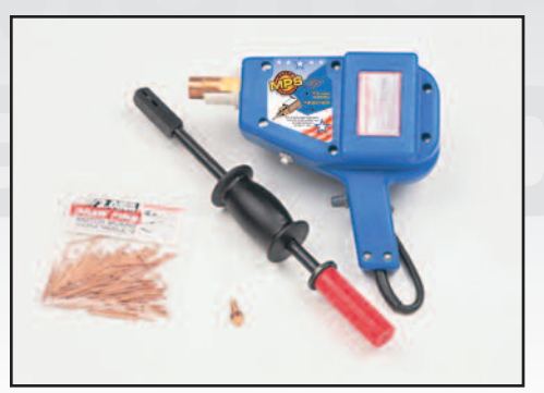
JO1000 - ENTRY KIT

The Magna-Spot® 1000, 1500 and 2000 Series products all incorporate our exclusive Low-Heat technology, designed for today's high-strength steel unibody vehicles. With plenty of power for any job, these welders virtually eliminate 'burn-through', a common problem associated with other models.