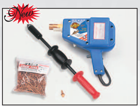
JO1050 - ENTRY-PLUS KIT