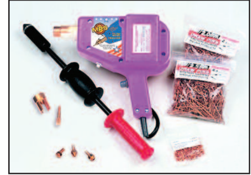
JO2000 - SUPER-PRO KIT