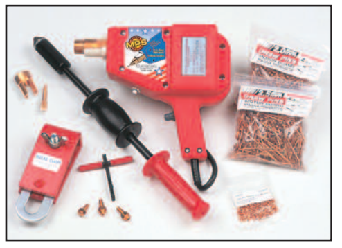
JO1550 - DELUXE KIT