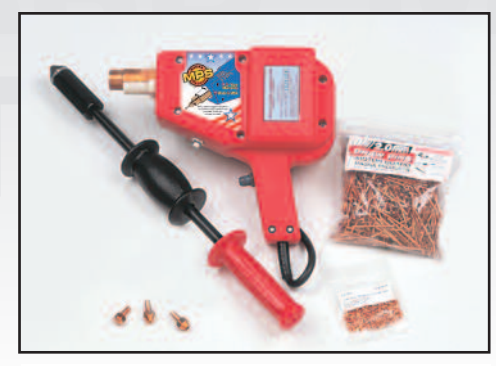
JO1500 - PROFESSIONAL KIT