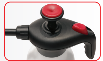
Completely enclosed to protect mechanisms from dust & dirt