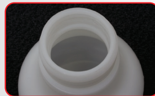
Large capacity canister & opening for easy filling