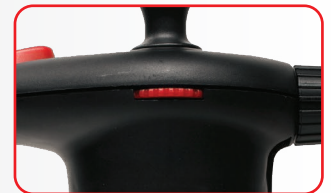
Built-in pressure relief valve