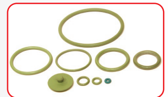
Pump sprayer gasket kit (Sold separately: #4002FPM)