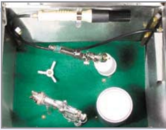
Stainless Steel Tank

Uni-ram Automatic Spray Gun Cleaners clean the interior and exterior of spray guns and pots in under 60 seconds