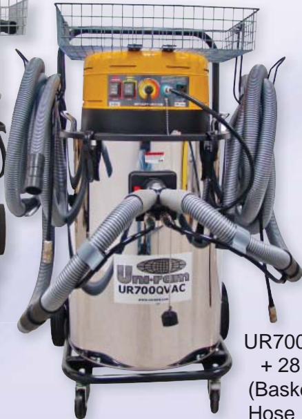
UR700QVAC + 28 -180 (Basket with Hose Hooks Sold Separately)