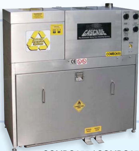
COMBO655 / COMBO656