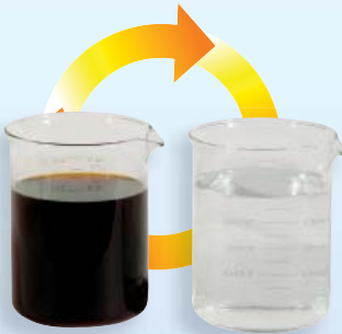
A closed loop system

purchases of solvent and the disposal costs of used solvent.